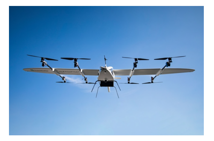
Fig. 1 The ALBACOPTER<sup>®</sup> – a cross between a multicopter and a glider

The consortium will be presenting some initial highlights at the IAA Mobility trade show in Munich in Hall B1, Booth D11, from September 5 to 8, 2023.